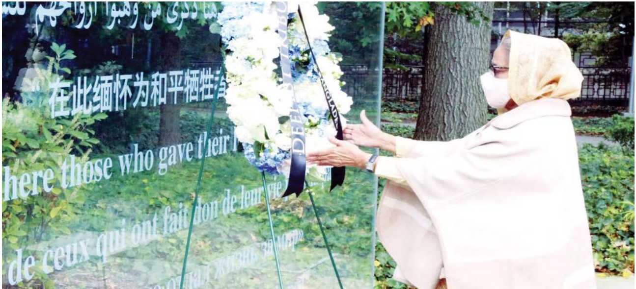
► Hon'ble Prime Minister, Her Excellency Sheikh Hasina is offering flower wreath to the United Nations Peacekeeper Memorials on 20 September 2021 at the United Nations Headquarters in honor of the fallen peacekeepers who sacrificed their lives for peace.

On 20 September 2021, Hon'ble Prime Minister laid flower wreath to the United Nations Peacekeepers Memorials in honor of the fallen peacekeepers who sacrificed their lives for peace.