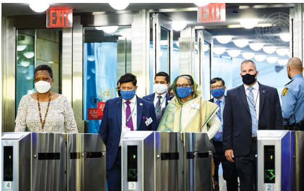
► Hon'ble Prime Minister is entering the General Assembly Hall on the first day of the general debate of the 76th Session of the United Nations General Assembly on 21 September 2021