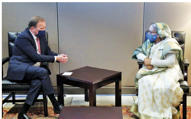
► H.E. Mr. Stefan Lofven, Hon'ble Prime Minister of Sweden meets with H.E. Sheikh Hasina, Hon'ble Prime Minister of Bangladesh on 21 September 2021 at the United Nations Headquarters