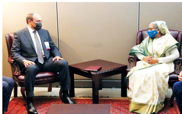
► H.H. Sheikh Sabah Khalad Al-Hamad Al-Sabah, Prime Minister of Kuwait meets H.E. Sheikh Hasina, Hon'ble Prime Minister of Bangladesh on 21 September 2021 at UNHQs