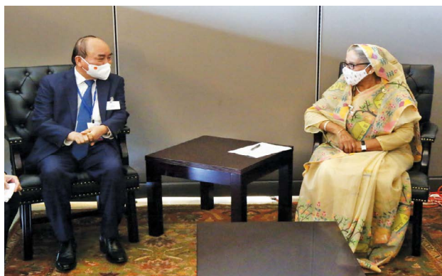
► H.E. Nguyen Xuan Phuc, President of Viet Nam meets H.E. Sheikh Hasina, Hon'ble Prime Minister of Bangladesh on 23 September 2021 at UNHQs