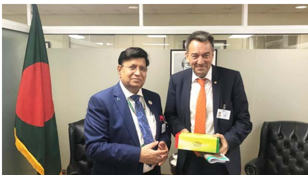
► Hon'ble Foreign Minister Dr. A. K. Abdul Momen, M.P. met the President of ICRC Mr. Peter Maurer