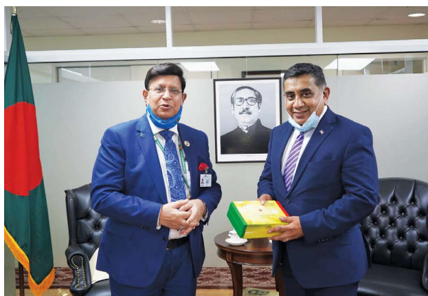
► Lord Tariq Ahmad, British Hon’ble State Minister for Foreign Affairs for South Asia, United Nations and the Commonwealth called on the Hon’ble Foreign Minister Dr. A. K. Abdul Momen, M.P. at the Permanent Mission of Bangladesh in New York on 23 September 2021