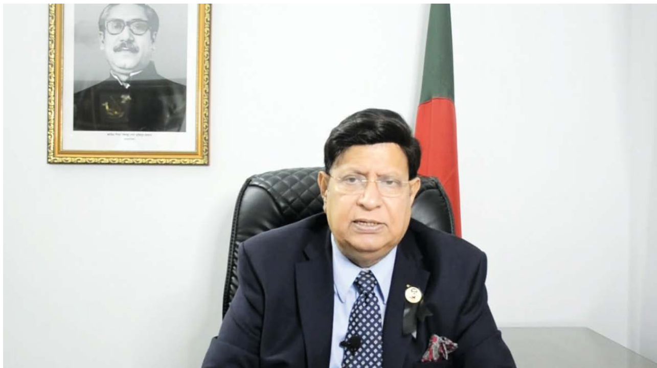
► Hon’ble Foreign Minister Dr. A. K. Abdul Momen, M.P. speaking at the United Nations High-Level Forum on the Culture of Peace held on 07 September 2021 at the United Nations General Assembly

of Peace focused on transformative role of the Culture of peace in promoting inclusion and resilience in the post COVID recovery.