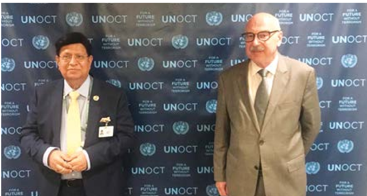
► Meeting between Hon'ble Foreign Minister Dr. A. K. Abdul Momen, M.P. and Mr. Vladimir Voronkov, the Under-Secretary-General of the United Nations Office of Counter-Terrorism