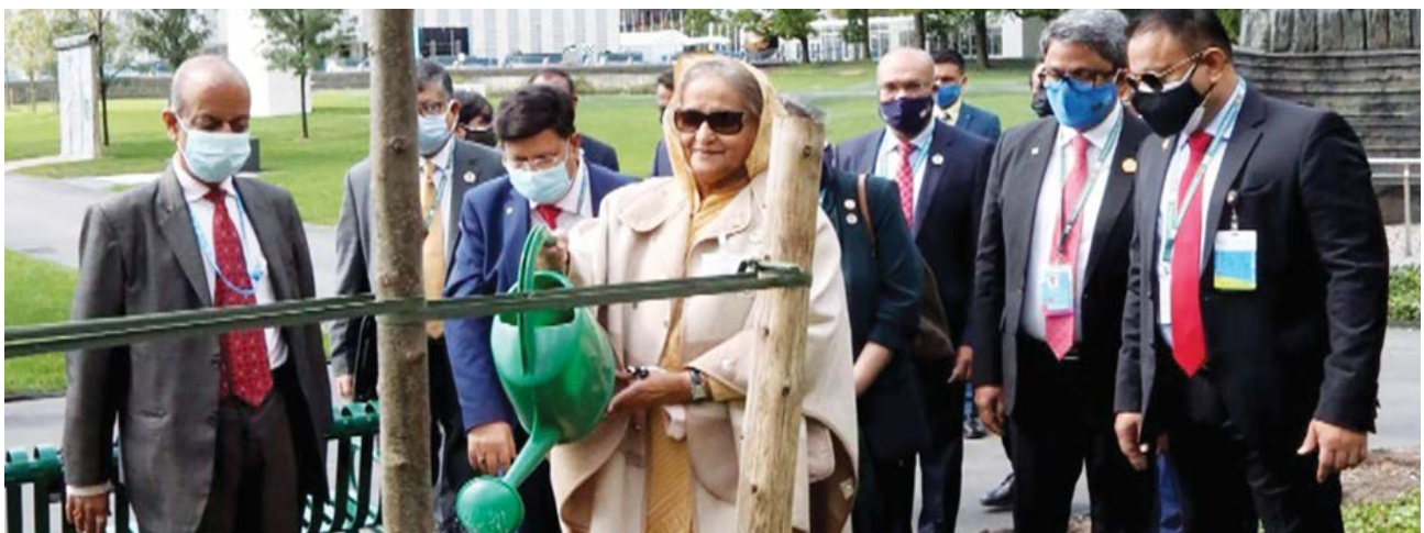
► Hon'ble Prime Minister, Her Excellency Sheikh Hasina is planting honey locust tree at the United Nations Garden on 20 September 2021 at the presence of Hon'ble Foreign Minister, Hon'ble State Minister, Bangladesh Permanent Representative to the United Nations Her Excellency Rabab Fatima and United Nations Under-Secretary General Atul Khare

reservoir of Bangladesh at the United Nations and tell the world about the glorious life and work of the Father of the Nations Bangabandhu Sheikh Mujibur Rahman.