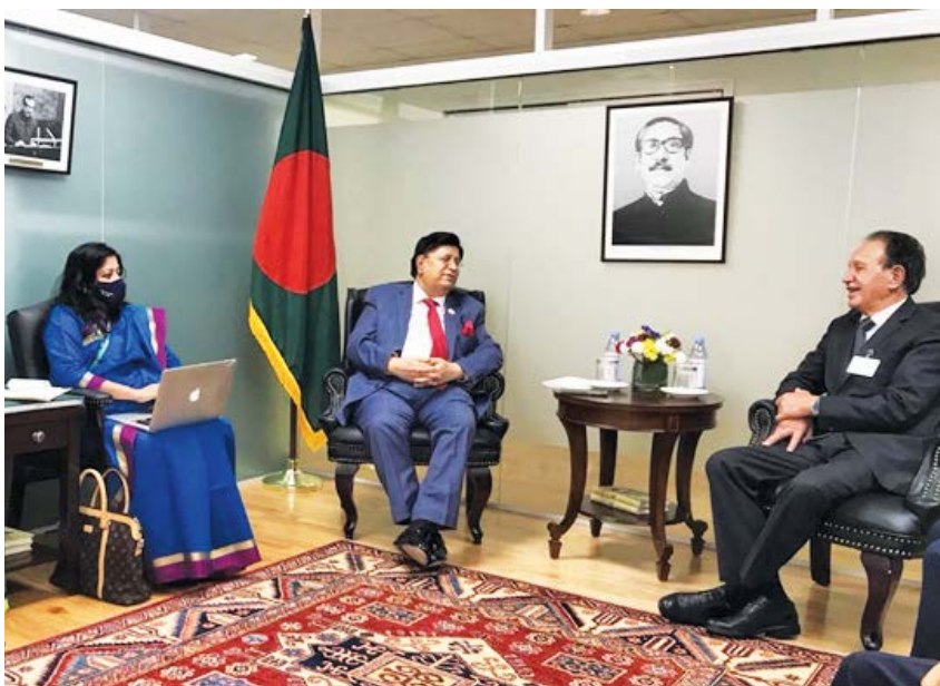
► Bilateral meeting between Hon'ble Foreign Minister Dr. A. K. Abdul Momen, M.P. and Dr. Narayan Khadka, Hon'ble Foreign Minister of Nepal

Hon'ble Foreign Minister of Bangladesh H.E. A.K. Abdul Momen had a bilateral meeting with the newly appointed Minister for Foreign Affairs of Nepal Dr. Narayan Khadka on 26 September 2021 on the sidelines of the 76th session of the United Nations General Assembly. During the meeting, the two Ministers discussed bilateral, regional and multilateral cooperation by enhancing collaboration in the areas of trade, investment, hydropower energy and cross-border energy trade. Both of them acknowledged the importance of existing people-to-people relations between the two countries. The Ministers agreed to accelerate and strengthen cooperation in various possible sectors for mutual benefits.