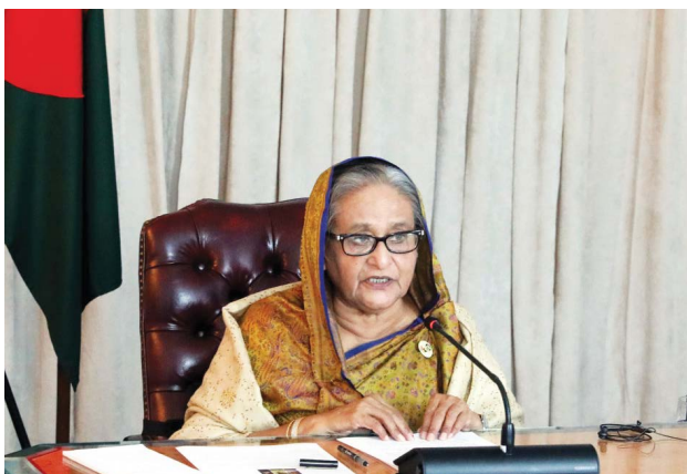
► Hon'ble Prime Minister is addressing the UN-High Level Meeting on Rohingya Crisis: Imperative for a sustainable solutions held on 22 September 2021