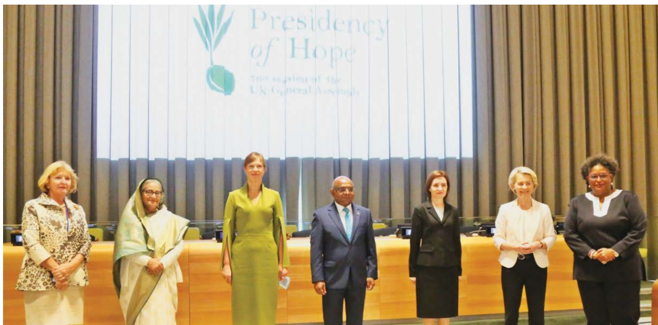
► Hon'ble Prime Minister of Bangladesh, Her Excellency Sheikh Hasina with the Women Leaders at the United Nations Headquarters during the UN Women Leader's Summit convened by the President of the 76th Session of the United Nations General Assembly H.E. Mr. Abdullah Shaheed (at the middle of the group photo) on 21 September 2021

On 21 September 2021, Her Excellency Sheikh Hasina, Hon'ble Prime Minister of Bangladesh attended the UN Women Leaders' Summit convened by the President of the General Assembly at the United Nations Headquarters. In her address, among others, Prime