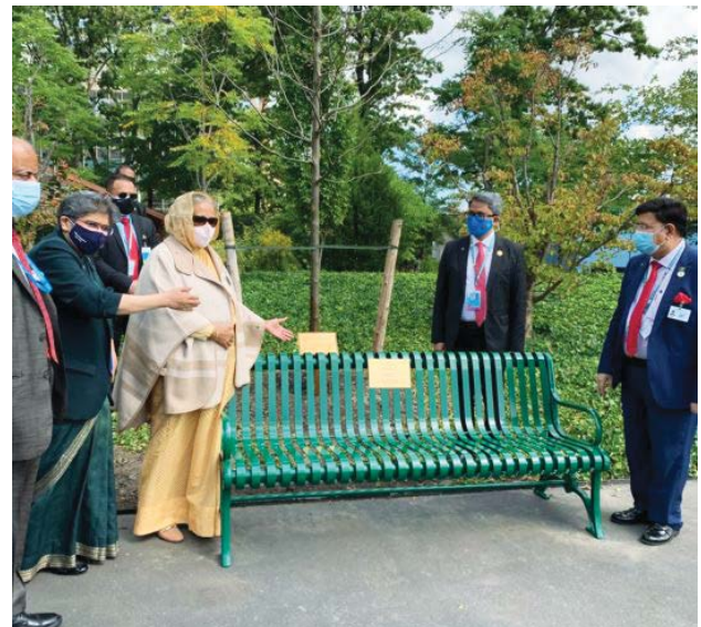
► Hon'ble Prime Minister, Her Excellency Sheikh Hasina is unveiling a Bench at the United Nations Garden on 20 September 2021 at the presence of Hon'ble Foreign Minister, Hon'ble State Minister, Bangladesh Permanent Representative to the United Nations Her Excellency Rabab Fatima and United Nations Under-Secretary General Atul Khare