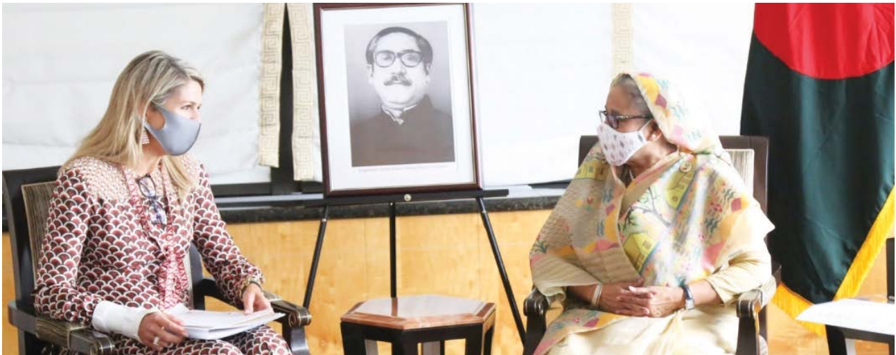
► H M Maxima, Queen of Netherlands meets H.E. Sheikh Hasina, Hon'ble Prime Minister of Bangladesh on 23 September 2021 in New York