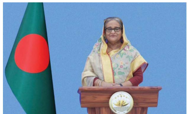
► Hon'ble Prime Minister is addressing at the United Nations Food System Summit on 23 September 2021 at the United Nations