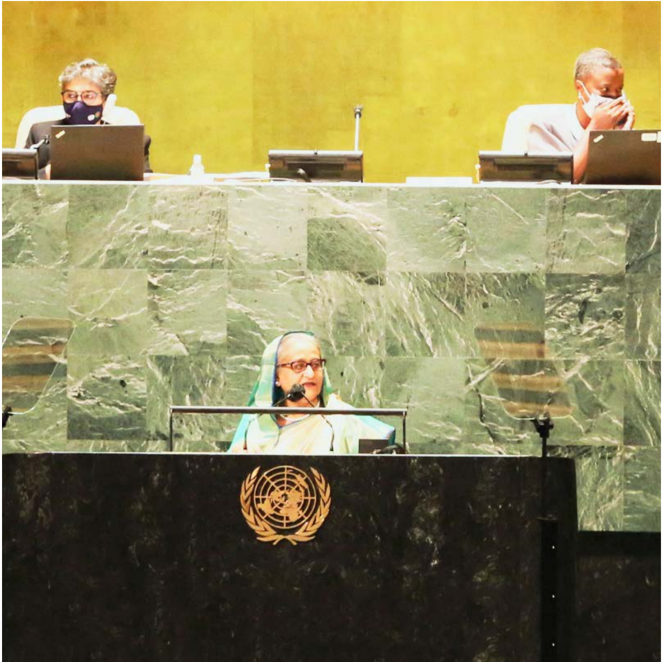
► Hon'ble Prime Minister of Bangladesh, Her Excellency Sheikh Hasina is addressing the general debate of the 76th Session of the United Nations General Assembly on 24 September 2021 at the General Assembly Hall of the UNHQs

H on'ble Prime Minister addressed the General Debate of the 76th Session of the United Nations General Assembly on 24 September 2021 at the General Assembly Hall of the UNHQs. Among others, her statement dominated the issues of Rohingya, climate change and post Covid-19 economic recovery, sustainable development, food security and eliminating inequality.