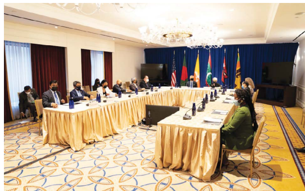
► Hon'ble State Minister for Foreign Affairs Mr. Md. Shahriar Alam, MP met the Deputy Secretary of State of USA Ms. Wendy R. Sherman on 22 September 2021 in New York