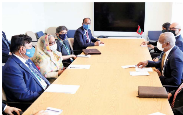
► H.E. Ibrahim Mohamed Solih, President of Maldives meets H.E. Sheikh Hasina, Hon'ble Prime Minister of Bangladesh on 23 September 2021 at UNHQs