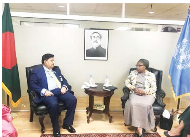
► Meeting between Hon'ble Foreign Minister Dr. A. K. Abdul Momen, M.P. and Ms. Alice Wairimu Nderitu, the United Nations Special Adviser on the Prevention of Genocide to UNSG