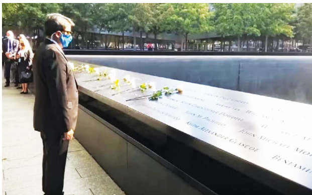
► Hon'ble State Minister for Foreign Affairs Mr. Md. Shahriar Alam, MP attended the Special Tribute Ceremony commemorating the 20th anniversary of 9/11 on the margins of the 76th Session of the United Nations General Assembly