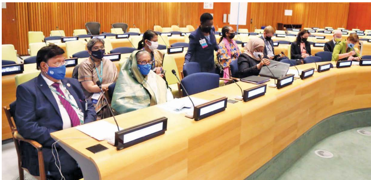
► Hon'ble Prime Minister of Bangladesh, Her Excellency Sheikh Hasina sitting at the UN Women Leaders' Summit with Hon'ble Foreign Minister DR. A. K. Abdul Momen and Bangladesh Permanent Representative to the United Nations Her Excellency Rabab Fatima

Minister laid special emphasis on forming a Women Leaders' Network as it can act as a force to ensure gender equality.