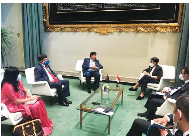
► Bilateral meeting between Hon'ble Foreign Minister Dr. A. K. Abdul Momen, M.P. and Retno Lestari Priansari Marsudi, Hon'ble Foreign Minister of Indonesia