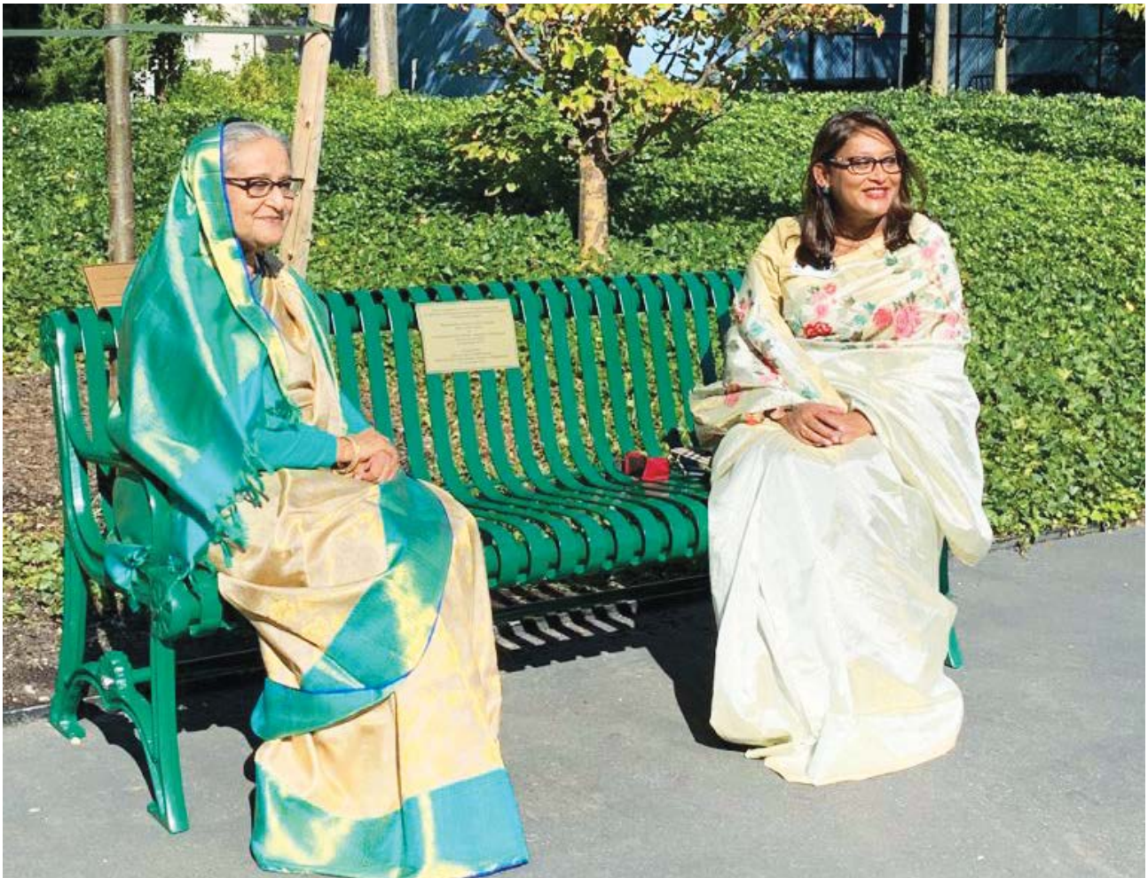
► Newly unveiled Bench at the UN Garden