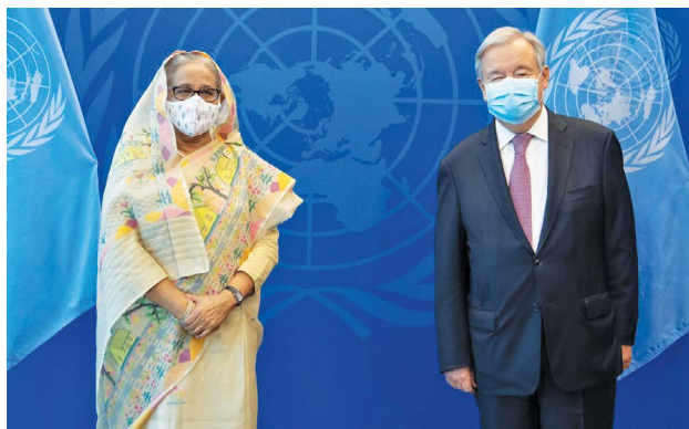
► United Nations Secretary-General António Guterres meets Her Excellency Sheikh Hasina, Hon'ble Prime Minister of Bangladesh on 23 September 2021 at the United Nations Headquarters

Minister of Barbados, President of Vietnam, Queen of Netherlands met Hon'ble Prime Minister.