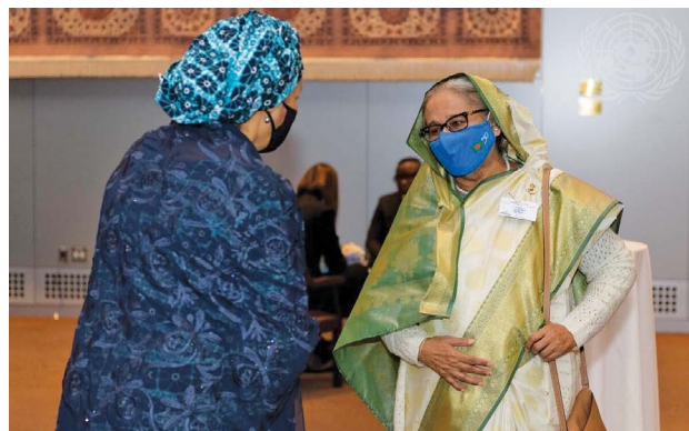
► Deputy Secretary-General Amina Mohammed meets with Her Excellency Sheikh Hasina, Hon'ble Prime Minister of Bangladesh on 21 September 2021 at the United Nations Headquarters