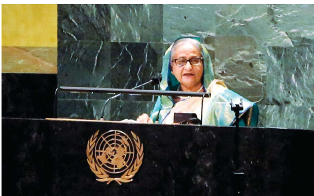
► Hon'ble Prime Minister of Bangladesh, Her Excellency Sheikh Hasina is addressing the general debate of the 76th Session of the United Nations General Assembly on 24 September 2021 at the General Assembly Hall of the UNHQs