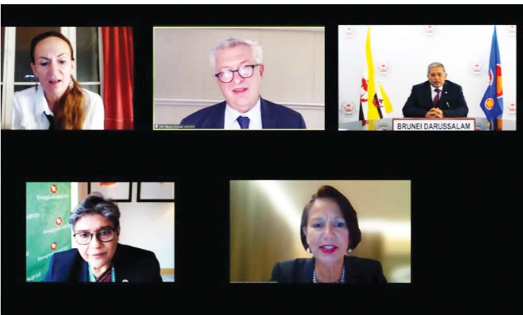
► Hon'ble Prime Minister is addressing the UN-High Level Meeting on Rohingya Crisis: Imperative for a sustainable solutions held on 22 September 2021