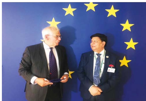
► Hon’ble Foreign Minister Dr. A. K. Abdul Momen, M.P. met Mr. Josep Borrell, the High Representative of the European Union for Foreign Affairs and Security Policy