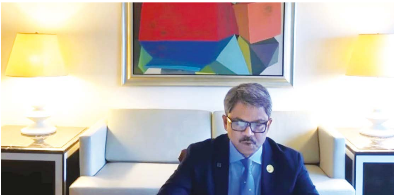
► Hon'ble State Minister for Foreign Affairs Mr. Md. Shahriar Alam, MP attended the 10th Ministerial Conference of the Community of Democracies on 22 September 2021 in New York