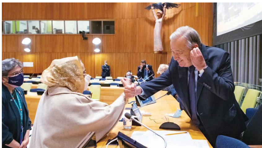
► UN Secretary-General António Guterres (right) greets Her Excellency Sheikh Hasina, Hon'ble Prime Minister of Bangladesh

Hon'ble Prime Minister Her Excellency Sheikh Hasina attended a High-level Leaders Round Table Meeting Meeting on Climate Change