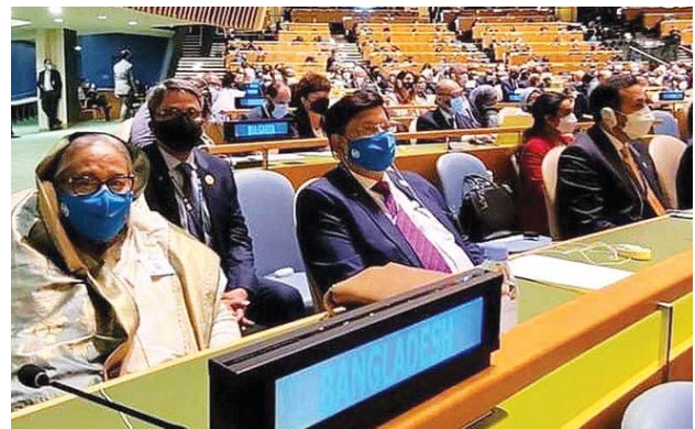
► Hon'ble Prime Minister Sheikh Hasina attended the opening ceremony of the General Debate of 76th UNGA on 21 September 2021. Hon'ble Foreign Minister and the Hon'ble State Minister for Foreign Affairs accompanied her in the event