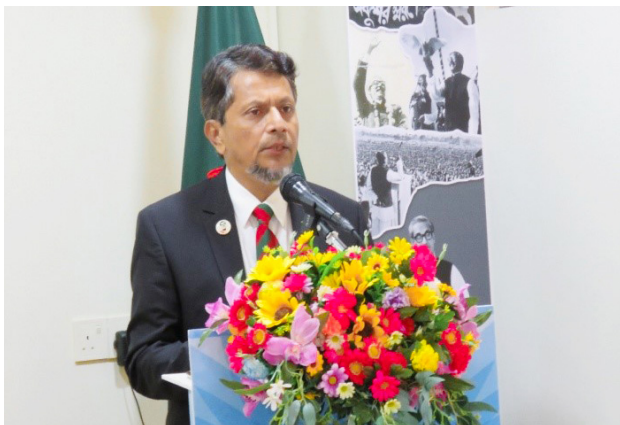
► High Commissioner of Bangladesh in Maldives, made his valuable remarks on the occasion of 'Bangabandhu's Conferment with Joliot-Curie Medal of Peace'