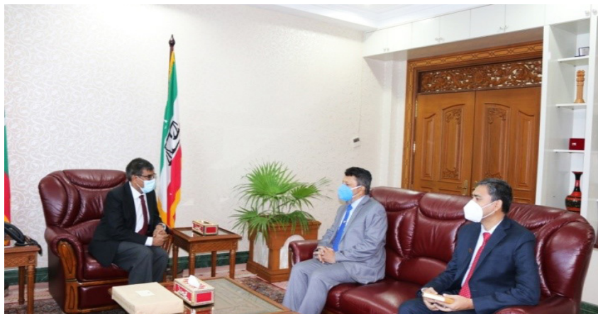
► Call on between the Chief Justice of Maldives and the High Commissioner of Bangladesh to Maldives

High Commissioner of Bangladesh to Maldives Mohammad Nazmul Hassan paid a courtesy call on Uz. Ahmed Muthasim Adnan, Chief Justice of Maldives on 2 May 2021. The High Commissioner requested for the support of Maldives Government's in providing defence lawyer to the Bangladeshi nationals during trial at the court considering the rule of fairness. The High Commissioner also requested for speedy disposal of ongoing cases of Bangladeshi nationals and remission of sentences of convicted prisoners.