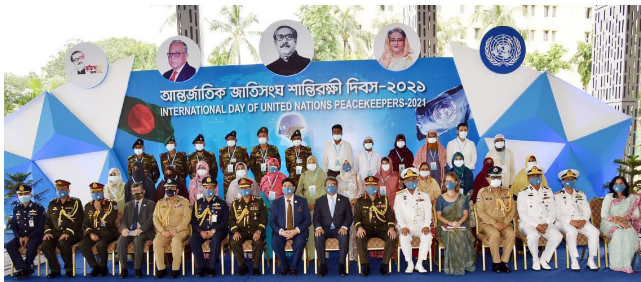
► Celebration of International Peacekeeping Day-2021 at Senakunja, 29 May 2021

The Ministry of Foreign Affairs, in cooperation with Armed Forces Division and Bangladesh Police jointly observed the International Day of Peacekeepers