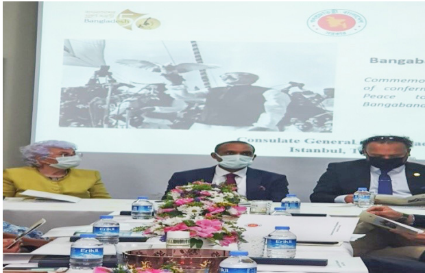
► Consulate General of Bangladesh in Istanbul organized a roundtable discussion titled 'Bangabandhu: A Symbol of Peace' on 27 May 2021