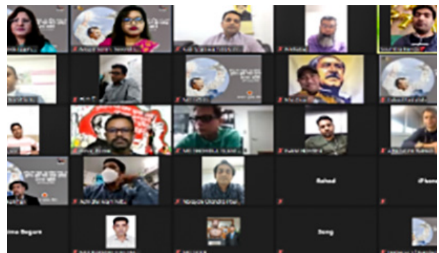
► The Embassy of Bangladesh, Seoul celebrated the 48th Anniversary of the Bangabandhu's receipt of Joliot-Curie Medal of Peace on 23 May 2021