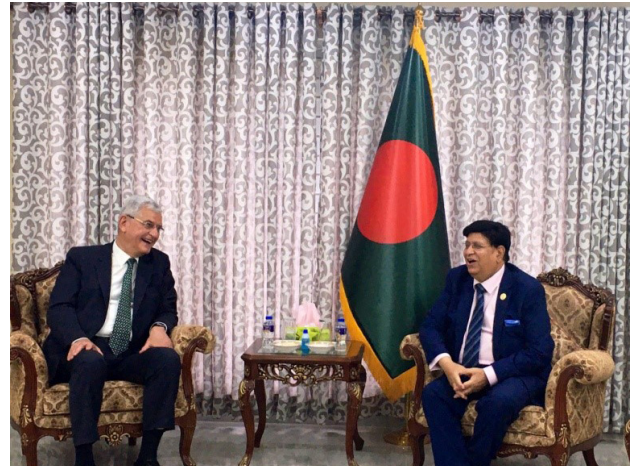
► H.E. Mr. Volkan Bozkir (L) met Hon'ble Foreign Minister Dr. AK Abdul Momen, MP (R) at the Foreign Service Academy on 25 May 2021

H.E. Mr. Volkan Bozkir, President of the 75 th Session of the UNGA (PGA), visited Bangladesh from 25 to 26 May 2021. During his visit, the PGA called on the Hon'ble Prime Minister at Ganabhaban. The PGA discussed with the Hon'ble Prime Minister about the plight of the Rohingya people, the situation in Myanmar, the impact of climate change, the importance of human-centric development, gender equality and women's empowerment, culture of peace and peacekeeping. Later, the PGA visited Bangabandhu