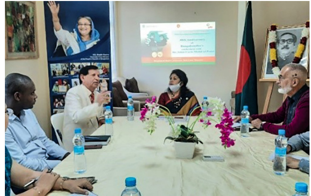
► Port Louis celebrates 48th Anniversary of Receiving 'Joliot-Curie Medal of Peace' by Bangabandhu Sheikh Mujibur Rahman