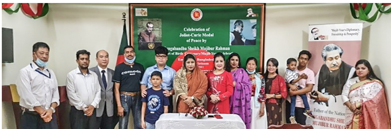
► Celebration of the 48th Anniversary of Bangabandhu's Conferment with "Joliot-Curie Medal of Peace" by Bangladesh Embassy, Hanoi

some missions celebrated the event virtually with the participation of embassy officials, diplomats, local dignitaries and members of the expatriate community. Some photos of the celebration by different missions are furnished below