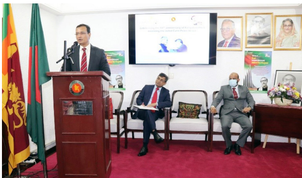
► Bangladesh High Commission in Colombo celebrated the 48th anniversary of the Father of the Nation Bangabandhu Sheikh Mujibur Rahman's receiving the 'Joliot-Curie Medal of Peace' on 23 May 2021