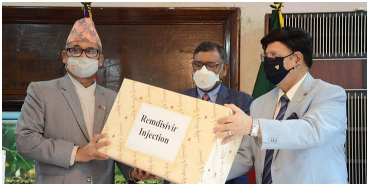
► On 11 May 2021, Ministry of Foreign Affairs sent to Nepal 5,000 vials of Remdisivir injection as gift from Hon'ble Prime Minister of Bangladesh to the Nepalese Ambassador in Dhaka

On 11 May, the Hon'ble Foreign Minister Dr. A. K. Abdul Momen, MP handed over a token box of 5,000 vials of Remdisivir injection to the Nepalese Ambassador in Dhaka, as gift from the Hon'ble Prime Minister of Bangladesh for the COVID-19 affected people of Nepal from 'SAARC