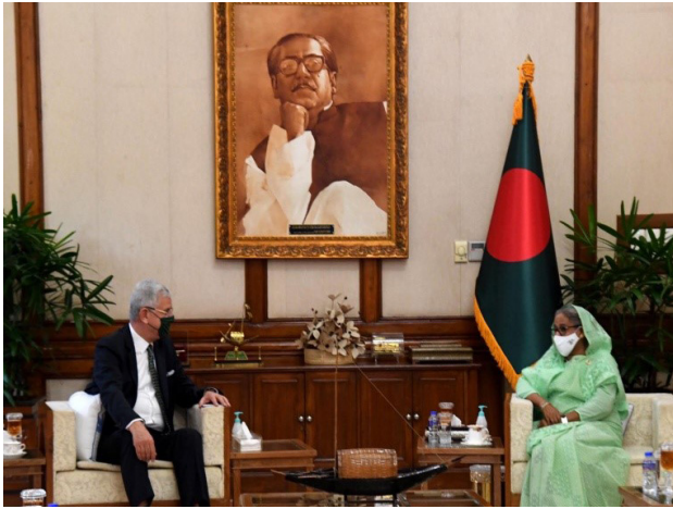
► H.E. Mr. Volkan Bozkir called on Hon'ble Prime Minister Sheikh Hasina at Ganabhaban on 25 May 2021