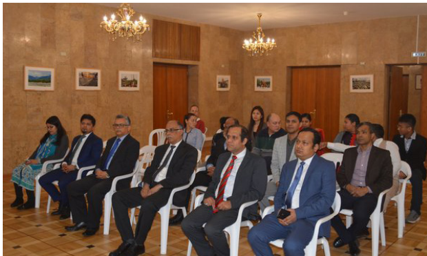
Ambassador attends the discussion on the Homecoming Day of Bangabandhu held in Bangladesh Embassy, Moscow