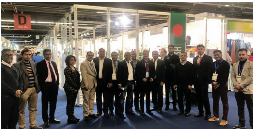
► The participating Bangladesh delegation are standing in front of the Bangladesh stall at Heimtextil Fair held in Frankfurt from 7-10 January 2020

opportunity to represent Bangladeshi products to a big international trade community. A delegation from the