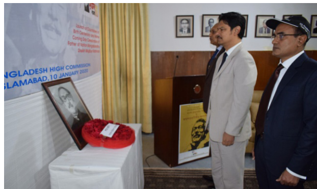
High Commissioner pays tribute to Bangabandhu in Bangladesh High Commission, Islamabad