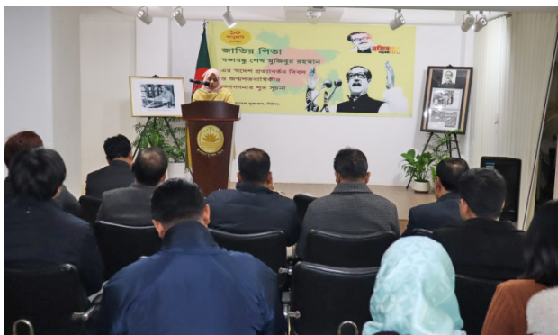
Participants join a discussion on the Homecoming Day of Bangabandhu held in Bangladesh Embassy, Seoul