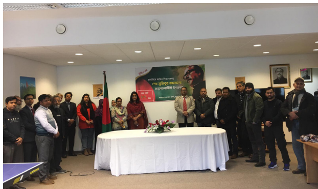
Ambassador inaugurates the countdown of ‘Mujib Borsho’ held in Bangladesh Embassy, Berlin

Mujibur Rahman and the significance of his Homecoming Day. The speakers paid their deep homage to the memory of the Father of the Nation and recalled his dedication for the country and his vision for establishing ‘Sonar Bangla’ (The Golden Bengal). They also expressed hope that through the celebration of ‘Mujib Borsho’ the young generation would get the unique opportunity to know about Bangabandhu and would be inspired to work for the development of the country. A gallery of photographs of different Missions celebrating the event is as follows: