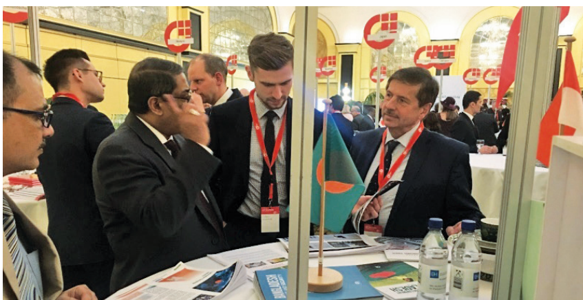
► German entrepreneurs visit Bangladesh stand and interact with the Ambassador at the BVMW Economic Forum held in Berlin on 27 January 2020

promoting Bangladeshi products in the world market. They showed keen interest in Bangladeshi products.