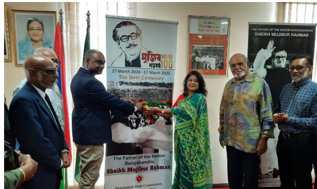
Lord Mayor of Port Louis and High Commissioner inaugurate the countdown in Bangladesh High Commission, Port Louis