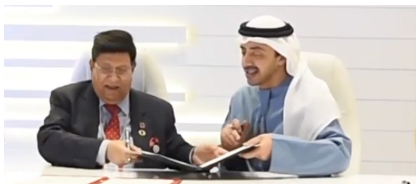
Foreign Minister Dr. A K Abdul Momen, MP and his UAE counterpart Sheikh Abdullah bin Zayed Al Nahyan exchange the Agreement on Allotment of land in Dhaka and in Abu Dhabi on the basis of the principle of reciprocity

Foreign Minister Dr. A K Abdul Momen, MP met with Sheikh Abdullah bin Zayed Al Nahyan, Minister of Foreign Affairs and International Cooperation of the