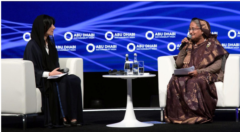
Prime Minister Sheikh Hasina took part in a key note interview titled 'The Critical Role of Women in Delivering Climate Action' at the Abu Dhabi National Exhibition Centre on 14 January 2020

Delegations of DP World of UAE, Emirates National Oil Company (ENOC), Saudi ARAMCO, ACWA Power of KSA and a prominent entrepreneur of the UAE separately met with Prime Minister Sheikh Hasina. She urged the DP World to invest in the ship-building sector, Payra port and in Bangladesh's Special Economic Zones and also urged them to set up a hi-tech park in Bangladesh. The representatives of ENOC, Saudi ARAMCO and ACWA Power of KSA expressed their interest in investing in power and energy sector in Bangladesh.