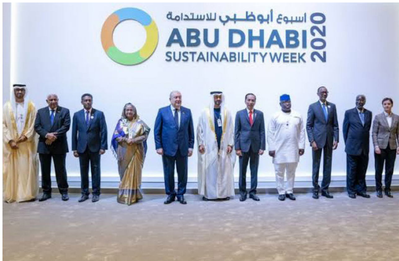
Prime Minister Sheikh Hasina attends the 'Abu Dhabi Sustainability Week 2020' on 13 January 2020 in Abu Dhabi, the UAE

Crown Prince of Abu Dhabi, Sheikh Mohamed bin Zayed bin Sultan Al-Nahyan received Prime Minister Sheikh Hasina at the opening ceremony of the 'Abu Dhabi Sustainability Week 2020' at the Abu Dhabi National Exhibition Centre (ADNEC) on 13 January 2020. She witnessed the 'Zayed Sustainability Award' giving ceremony.