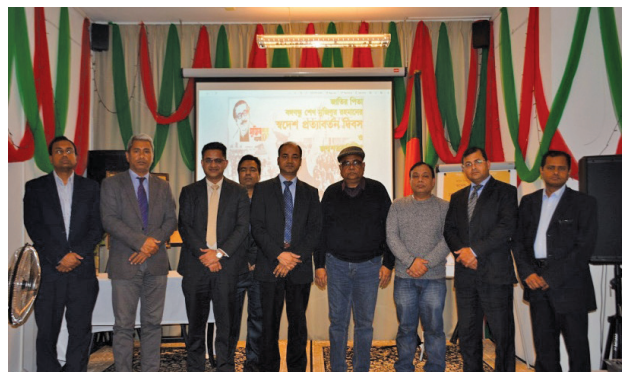
Participants join a discussion on the Homecoming Day of Bangabandhu held in Bangladesh Embassy, The Hague