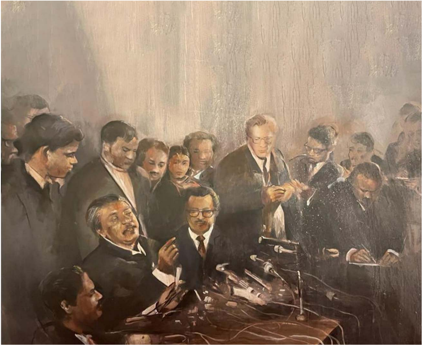
'Bangabandhu: Unbounded Joy of Freedom' painting by Artist Jamal Uddin Ahmed