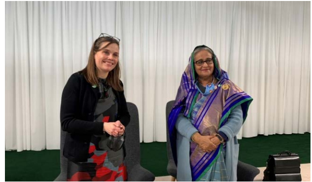
► Hon'ble Prime Minister and the Prime Minister of Iceland Katrín Jakob dóttir interacting at the COP26