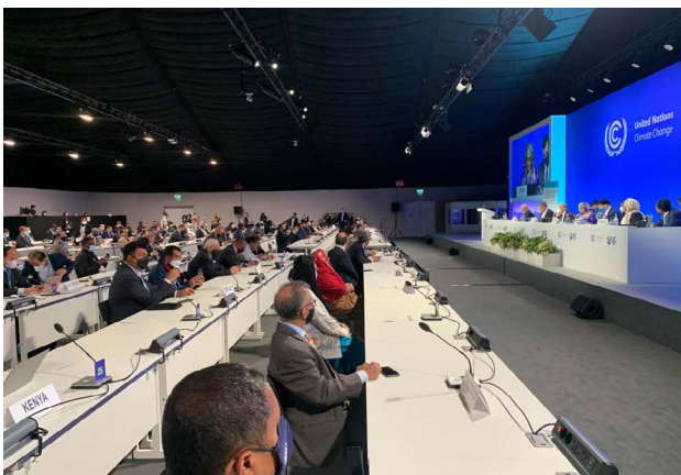
▶ Distinguished participants at the first CVF-COP Leaders' Summit held at the sidelines of the COP26 under Bangladesh's CVF Presidency