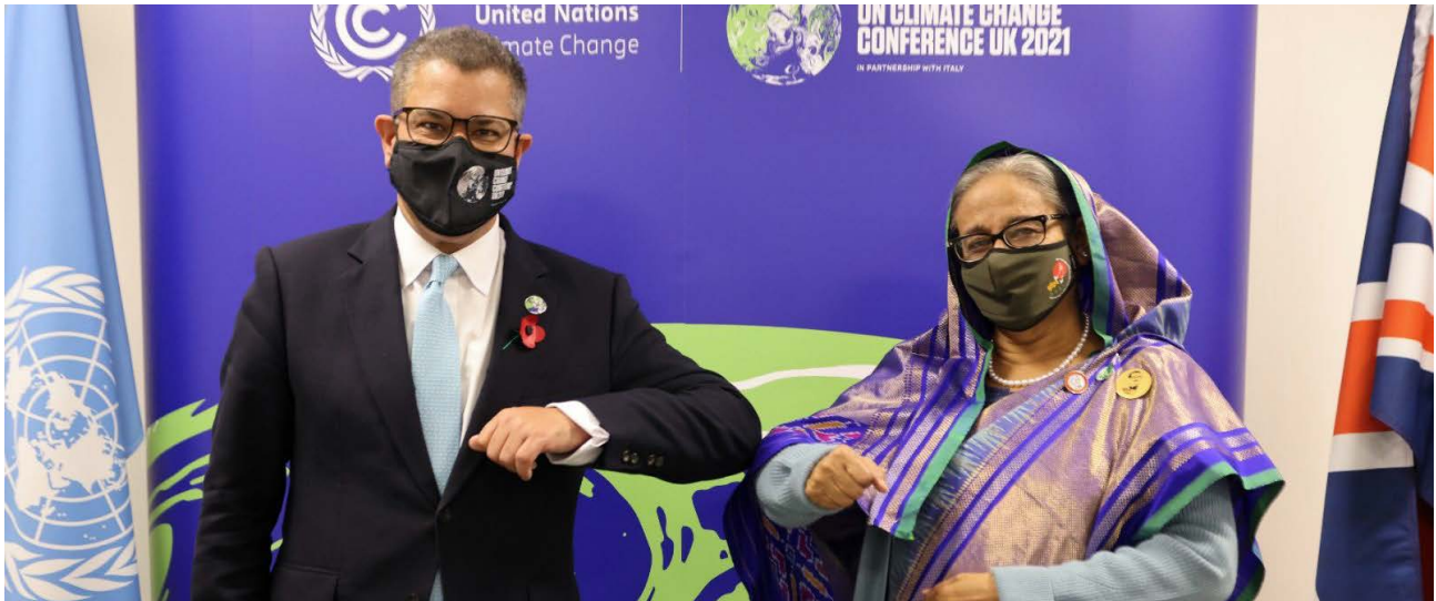
► COP26 President Alok Sharma called on the Hon'ble Prime Minister H.E. Sheikh Hasina in the sidelines of the WLS, Glasgow, 02 November 2021 and discussed Bangladesh-UK climate cooperation