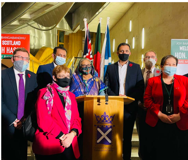
► Hon'ble Prime Minister H.E. Sheikh Hasina with Members of the Scottish Parliament, 02 November 2021