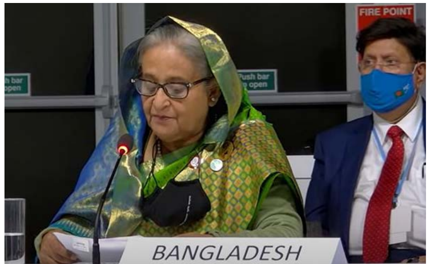
► Hon’ble Prime Minister Her Excellency Sheikh Hasina addressed the COP26 Leaders’ Event, “Action and Solidarity: the Critical Decade”. Hon’ble Foreign Minister Dr. A. K. Abdul Momen, MP accompanied the Hon’ble Prime Minister

At the COP26 Leaders’ meeting titled ‘Action and Solidarity – the Critical Decade’ co-hosted by British Prime Minister Rt Hon Boris Johnson and Prime Minister of Italy Mario Draghi, Hon’ble Prime Minister Her Excellency Sheikh Hasina called upon the developed countries to fulfil their commitment of annual 100 billion dollars climate finance with 50:50 allocations for adaptation and mitigation to address effective global adaptation actions. UN Secretary-General António Guterres, President of the European Council Charles Michel, European Commission President Ursula von der Leyen also spoke, among others, at the COP26 Action and Solidarity session in Glasgow on 01 November 2021.