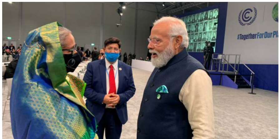
► Hon'ble Prime Minister and the Prime Minister of India Shri Narendra Modi interacting at the COP26 plenary