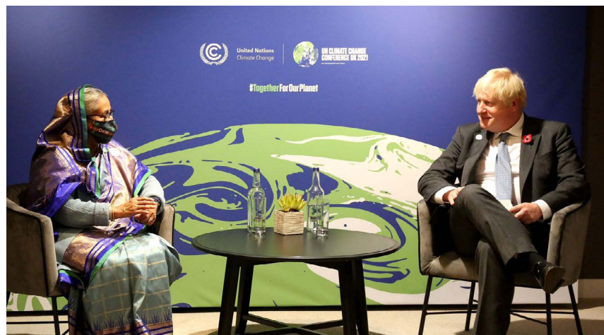
▶ British Prime Minister the Rt Hon Boris Johnson meets with H.E. Sheikh Hasina in a bilateral meeting on 02 November 2021 in Glasgow

On the sidelines of the COP26, Hon'ble Prime Minister Sheikh Hasina held a highly productive bilateral meeting with her British counterpart Prime Minister Boris Johnson on 02 November 2021 in Glasgow. The two Prime Ministers reflected on the 50th anniversary of Bangladesh-UK diplomatic relations, and reaffirmed the value-based foundation of Bangladesh-UK friendship laid by the Father of the Nation Bangabandhu Sheikh Mujibur Rahman and the then British Prime Minister Sir Edward Heath. The two leaders agreed to take next 50 years of Bangladesh-UK relations to a strategic partnership harnessing