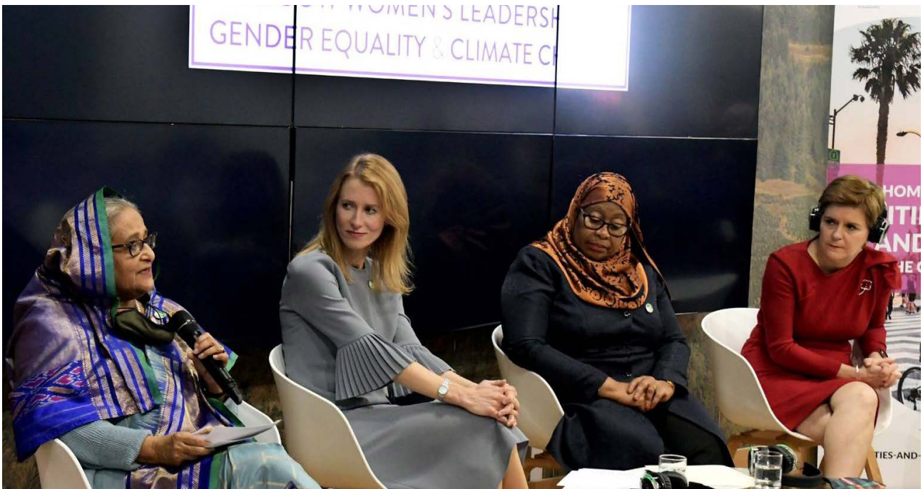
► "... We believe recognising the vulnerabilities of women in climate change response is critical. My government is fully committed to ensuring women become part of the solutions to climate change by creating space for them to contribute to all aspects of sustainable development..."

-Her Excellency Sheikh Hasina COP26 High-Level Panel on Women and Climate Change