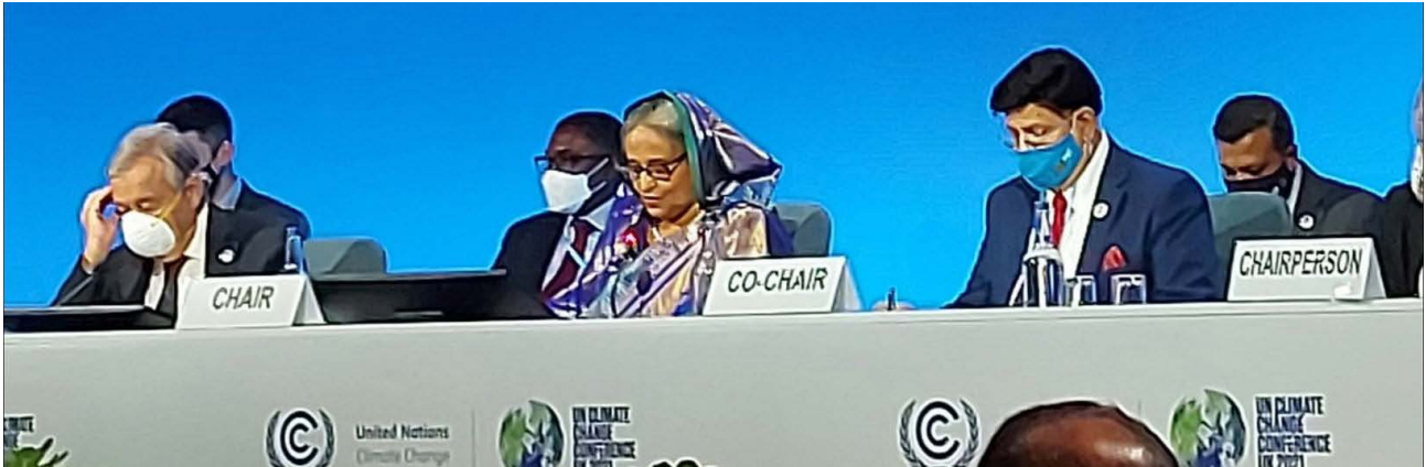
► Hon'ble Foreign Minister His Excellency Dr. A. K. Abdul Momen MP co-chaired the CVF Leaders' Summit in the sidelines of the COP26 World Leaders Summit, Glasgow, 02 November 2021