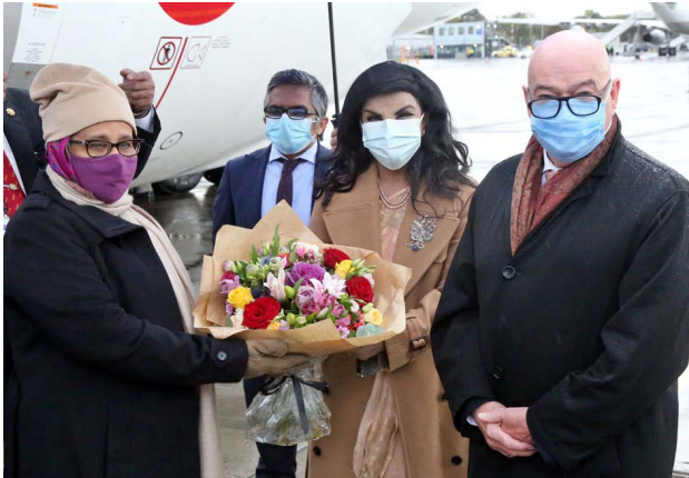
▶ Hon'ble Prime Minister was received at the Glasgow Airport by Her Excellency Saida Muna Tasneem, Bangladesh High Commissioner in the UK, 31 October 2021