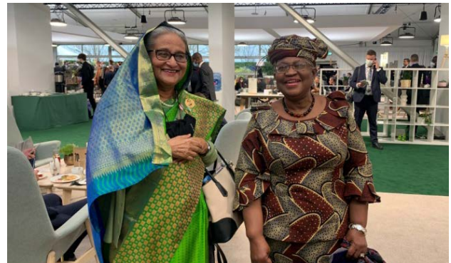
► Hon'ble Prime Minister and the Director General of the World Trade Organization Ngozi Okonjo-Iweala interacting at the COP26