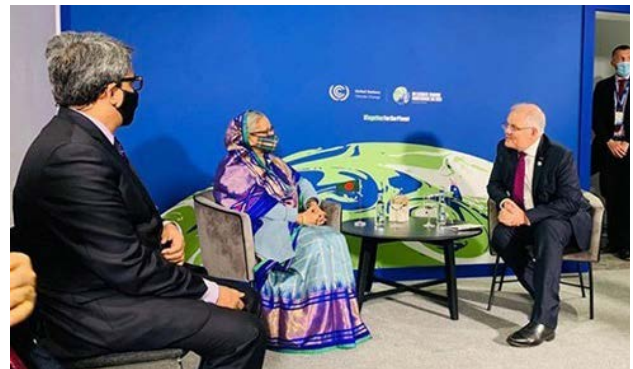
► Hon'ble Prime Minister H.E. Sheikh Hasina holding a bilateral meeting with Australian Prime Minister Scott Morrison, 02 November 2021, Glasgow