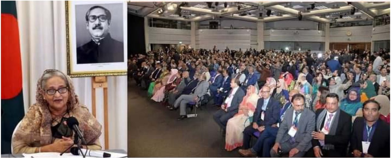
▶ Hon'ble Prime Minister spoke as Chief Guest at a community reception hosted in her honour by Bangladeshi Diaspora in London, 07 November 2021