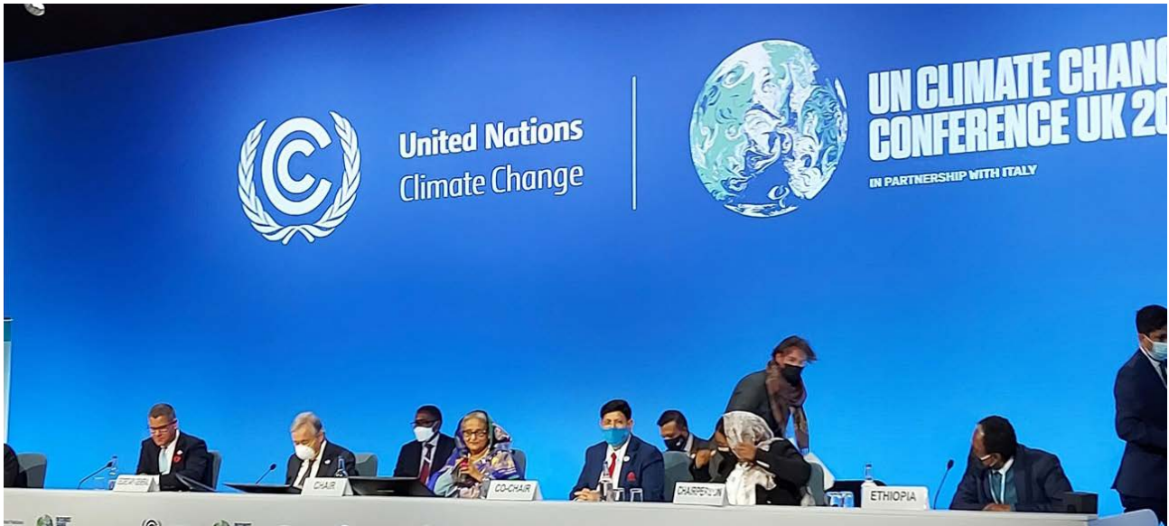
► Hon’ble Prime Minister Her Excellency Sheikh Hasina chairs the first CVF-COP Leaders Summit in Glasgow participated by, among others, COP26 President Alok Sharma, UN Secretary General António Guterres and the CVF Leaders

Summit, Hon’ble Prime Minister articulated global priorities of nations most threatened by the climate emergency, and leveraging utmost ambition in climate action in favour of the CVF.