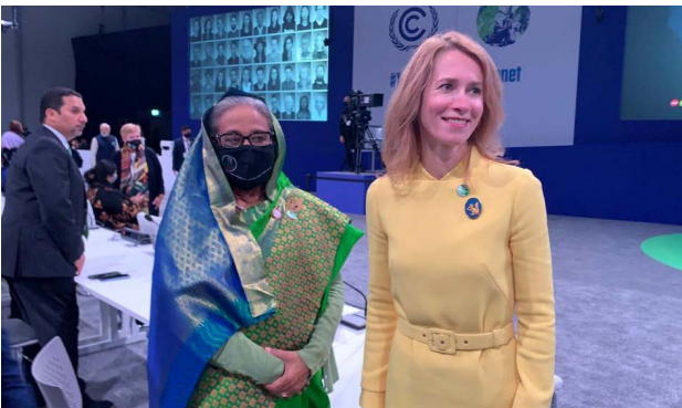
► Hon'ble Prime Minister and the Prime Minister of Estonia Kaja Kallas