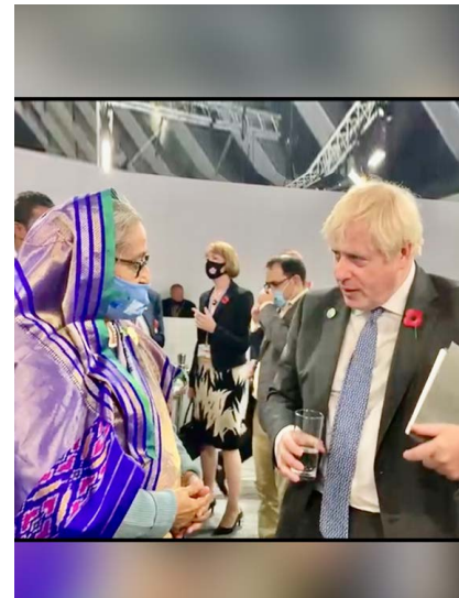
▶ Hon'ble Prime Minister Her Excellency Sheikh Hasina with the Commonwealth Chair-in-Office British Prime Minister at the Commonwealth Leaders Royal Reception in Glasgow