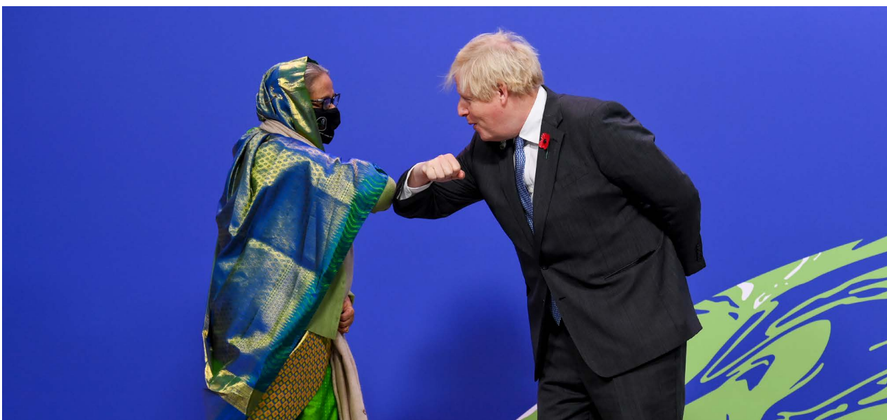
► At the plenary of the World Leaders Summit, Hon'ble Prime Minister exchanged greetings with the world leaders including Prime Minister of the United Kingdom, host of the COP26

Rohingyas in Bangladesh. Hon'ble Prime Minister called upon the major emitters to submit ambitious NDCs, fulfil climate finance pledges, transfer clean and green technology, and address the issue of loss and damage.