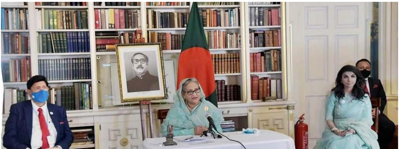
▶ Hon'ble Prime Minister spoke as Chief Guest at a community reception hosted in her honour by Bangladeshi Diaspora in Scotland, 01 November 2021