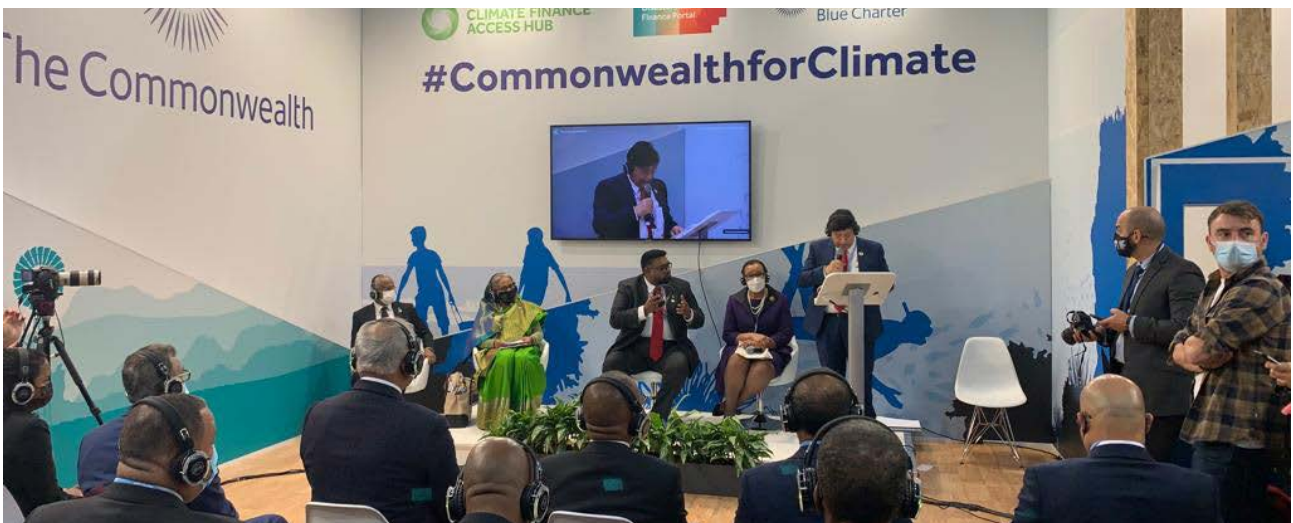
► Hon'ble Foreign Minister His Excellency Dr. A. K. Abdul Momen MP moderated the first Commonwealth-CVF Leaders' Summit in the sidelines of the COP26 World Leaders Summit, Glasgow, 01 November 2021