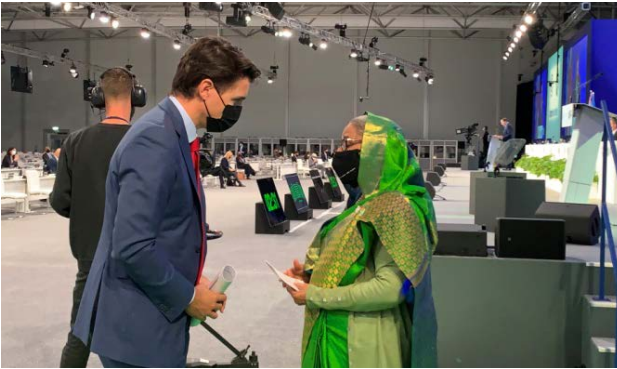
► Hon'ble Prime Minister and the Prime Minister of Canada Justin Trudeau interacting at the COP26 plenary