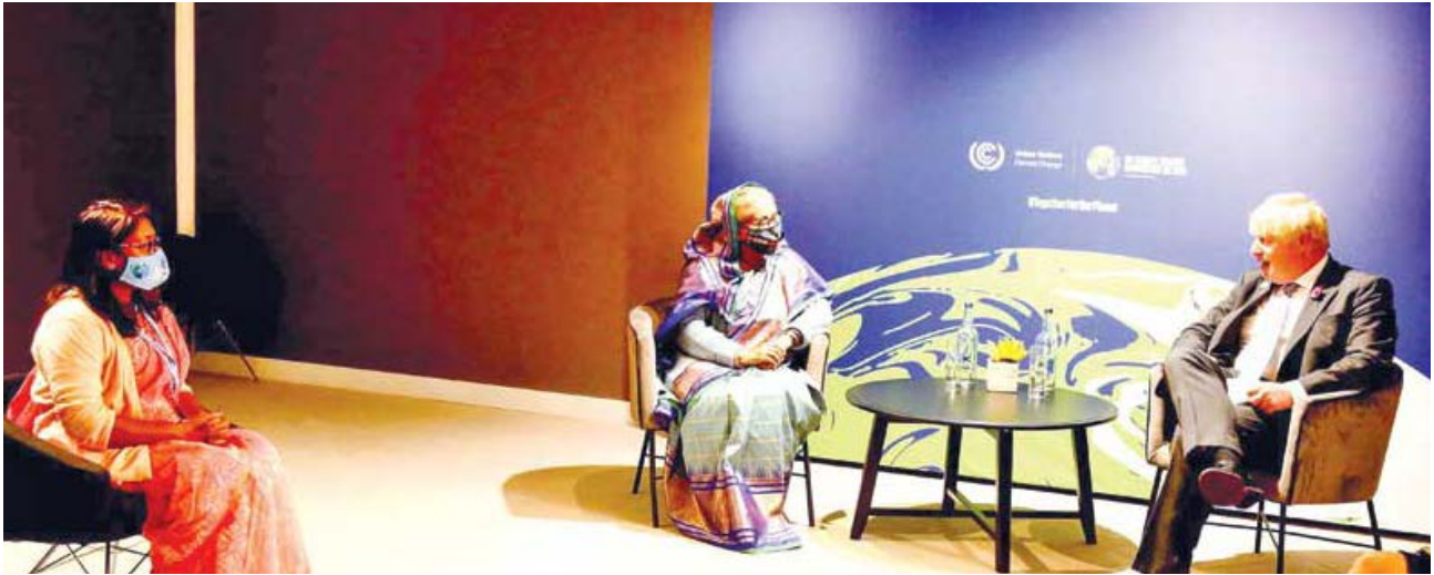
► Her Excellency Ms. Saima Wazed Hossain, CVF Thematic Ambassador for Vulnerability accompanied Hon'ble Prime Minister at the meeting