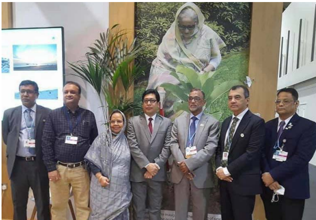
▶ Hon'ble Minister for Environment, Forest and Climate Change H.E. Mr. Md. Shahab Uddin M.P., Deputy Minister for Environment, Forest and Climate Change H.E. Habibun Nahar M.P., Hon'ble State Minister for Foreign Affairs H.E. Mr. Mohammad Shahriar Alam MP, Hon'ble State Minister for Public Administration H.E. Mr. Farhad Hossain with esteemed COP26 high-level members of Bangladesh delegation at Bangladesh Pavilion, COP26, Glasgow