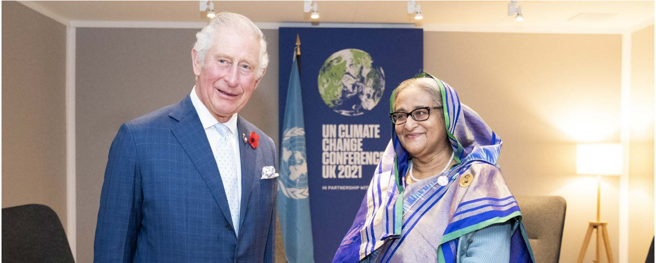
▼ His Royal Highness The Prince of Wales held bilateral meeting with Hon'ble Prime Minister H.E. Sheikh Hasina at Glasgow on 02 November 2021. Prince Charles praised the Mujib Climate Prosperity Plan (MCPP) and expressed interest to work closely with Hon'ble Prime Minister to create collaboration between MCPP and the Prince's Sustainable Market Initiative (SMI)