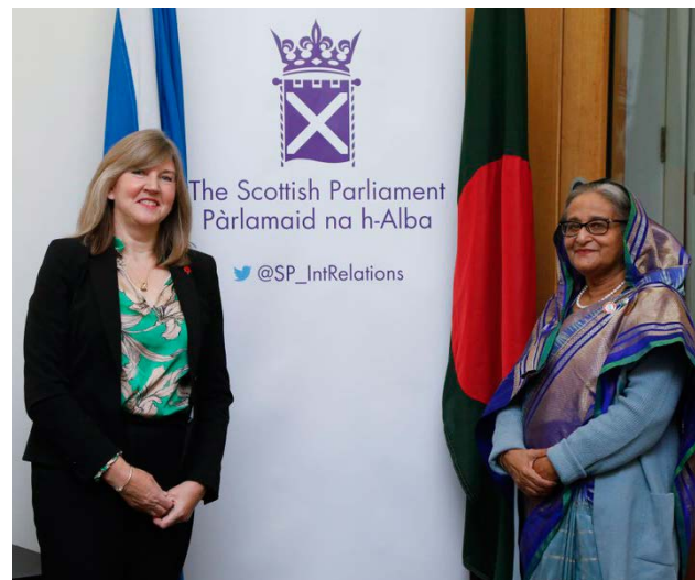
► Speaker of the Scottish Parliament Alison Johnstone MSP received Hon'ble Prime Minister H.E. Sheikh Hasina at the Scottish Parliament, 02 November 2021