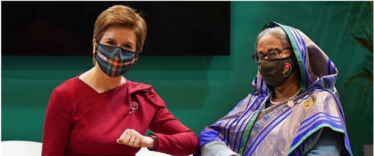
► First Minister of Scotland Nicola Sturgeon called on the Hon'ble Prime Minister H.E. Sheikh Hasina at Bangladesh Pavilion and discussed trade, investment and climate cooperation between Bangladesh and Scotland