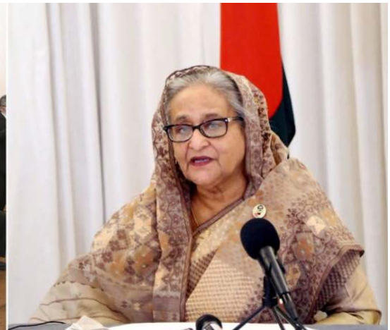
► Hon'ble Prime Minister addressed inauguration of the BHC London extended Chancery Bhaban on 07 November 2021. Hon'ble Foreign Minister Dr. A.K. Abdul Momen MP and Madam Selina Momen with Hon'ble Information Minister, Prime Minister's Hon'ble Private Industry and Investment Adviser, Hon'ble Members of Parliament and Senior Government Officials were present among others at the inauguration ceremony