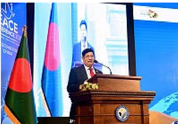
► Hon'ble Foreign Minister H.E. Dr A K Abdul Momen MP addressed as Guest of Honour at the Bangladesh Investment Summit 2021 concluding session, 04 November 2021, London