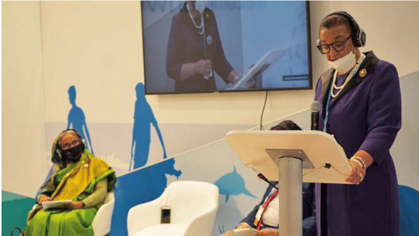
► Commonwealth Secretary General announces the first Commonwealth-Bangladesh Bangabandhu Sheikh Mujibur Rahman Green Business Award at the Commonwealth Pavilion in the sidelines of the COP26, 01 November 2021

Commonwealth Secretary General Baroness Patricia Scotland and Chairman of the Commonwealth Enterprise and Investment Council (CWEIC) Lord Marland of Odstock jointly announced the