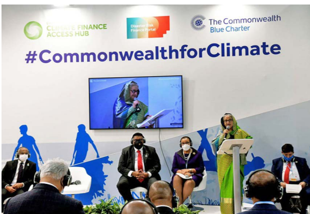
► Hon'ble Prime Minister addressing the Commonwealth-CVF Leaders Dialogue as Chief Guest, 01 November 2021

Minister of Eswatini Cleopas Dlamini, Prime Minister of Saint Lucia Hon. Philip J. Pierre, and Commonwealth Secretary-General Baroness Patricia Scotland attending the leaders dialogue supported the Bangladesh-proposed Commonwealth-CVF climate prosperity partnership.