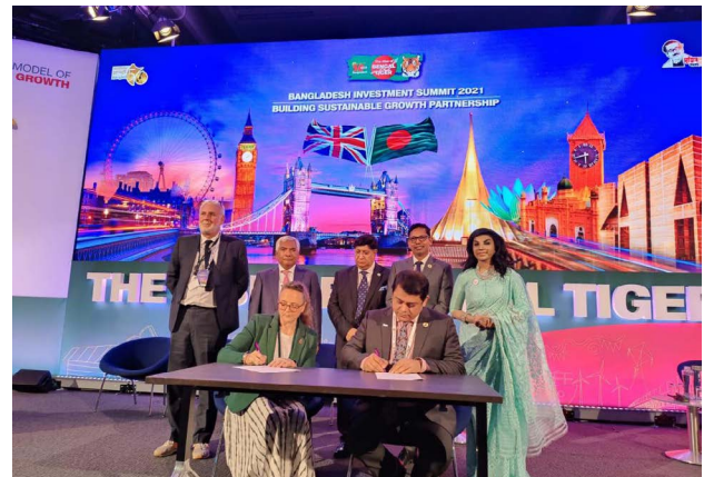
► At the initiative of Bangladesh High Commission, London, two bilateral MoUs were signed during the Bangladesh Investment Summit 2021 in London. The first MoU is on mutual certification between the Bangladesh Association of Software and Information Services (BASIS) and British Computer Society (BCS), and the second on a PwC UK Market Survey between FBCCI and HSBC