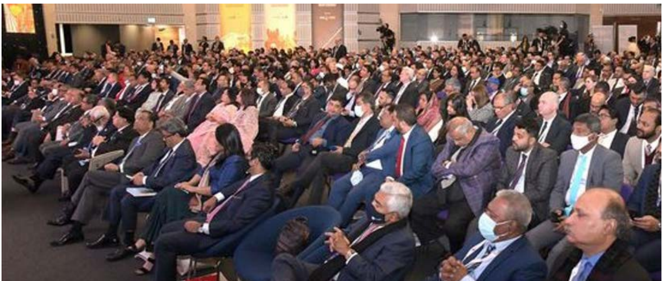
► The participants at the 'Bangladesh Investment Summit 2021: Building Sustainable Growth Partnerships' at the Queen Elizabeth II Centre, London, 04 November 2021

Hon'ble Prime Minister H.E. Sheikh Hasina Bangladesh Investment Summit 2021 London, 04 November 2021