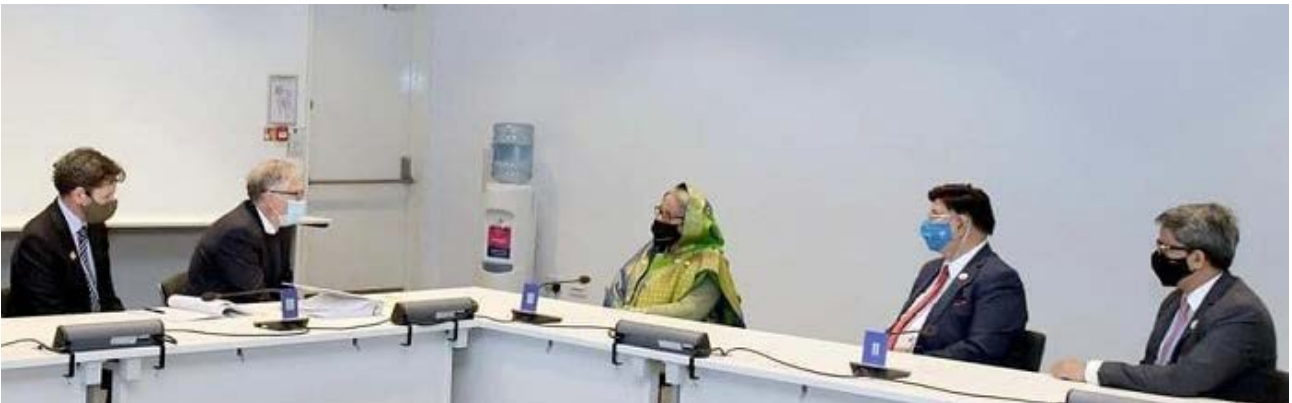
► Mr. Bill Gates called on Hon'ble Prime Minister H.E. Sheikh Hasina on the sidelines of COP26 in Glasgow