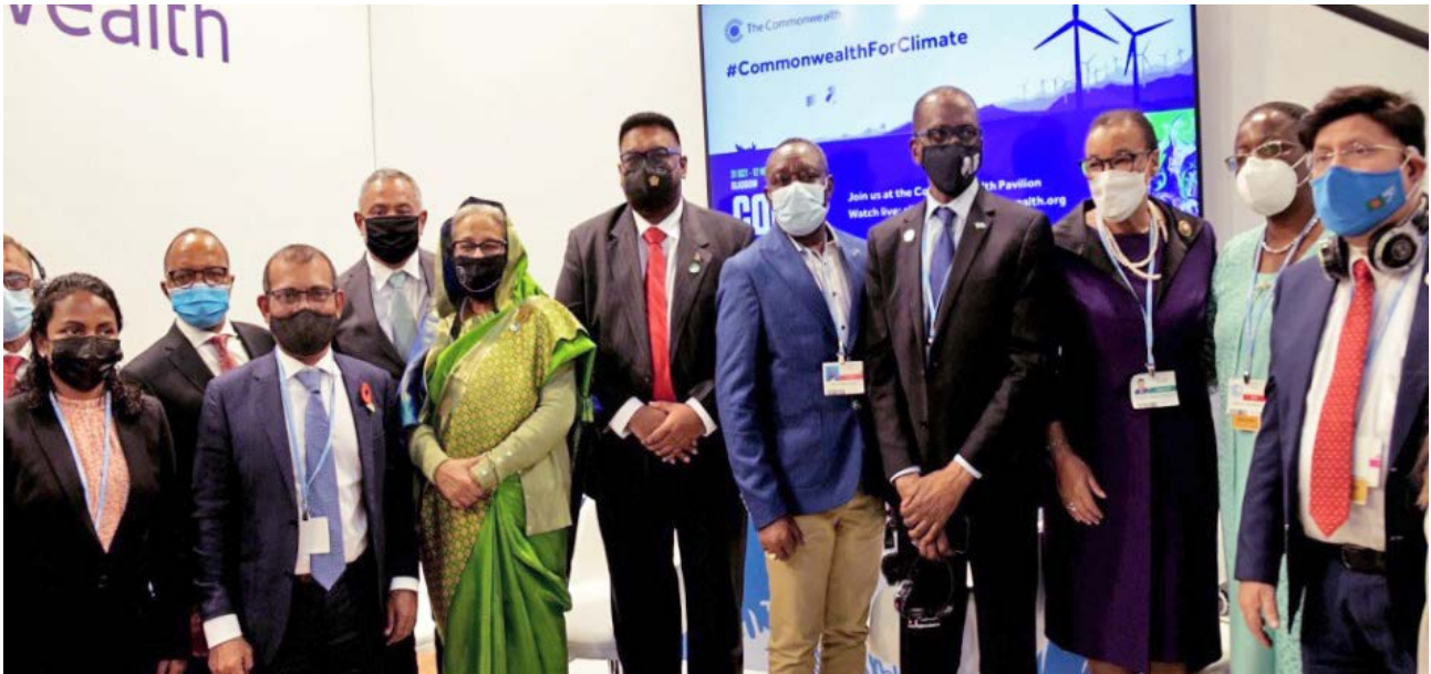
► Hon'ble Prime Minister Her Excellency Sheikh Hasina with Commonwealth and CVF leaders at the Commonwealth-CVF High-level Dialogue, Glasgow 01 November 2021

Hon'ble Prime Minister attended as Chief Guest the first Commonwealth-CVF Leaders Dialogue organized by Bangladesh Presidency of the CVF in partnership with the Commonwealth Secretariat on 01 November 2021 at the Commonwealth Pavilion on the sidelines of the COP26. In her speech as CVF President, Hon'ble Prime Minister called for creating