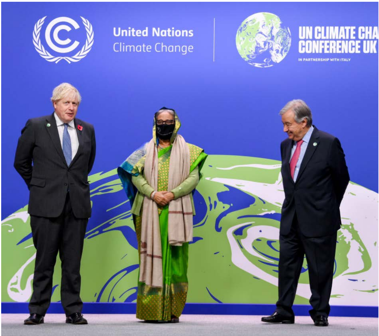
► Hon'ble Prime Minister of Bangladesh, Her Excellency Sheikh Hasina was very warmly received by British Prime Minister Rt Hon Boris Johnson and UN Secretary General António Guterres at the COP26 World Leaders Summit at the Scottish Event Campus in Glasgow, United Kingdom on 01 November 2021

Hon'ble Prime Minister Her Excellency Sheikh Hasina led Bangladesh at the COP26 in Glasgow, United Kingdom, and attended the two-day World Leaders Summit of the COP26 on 01-02 November 2021 hosted by the UK. She was acknowledged as “the Voice of the Vulnerable” by the BBC being one of the top five global dealmakers to influence negotiations at the Glasgow COP26 and a strong moral voice who spoke on behalf of countries most threatened by climate change.