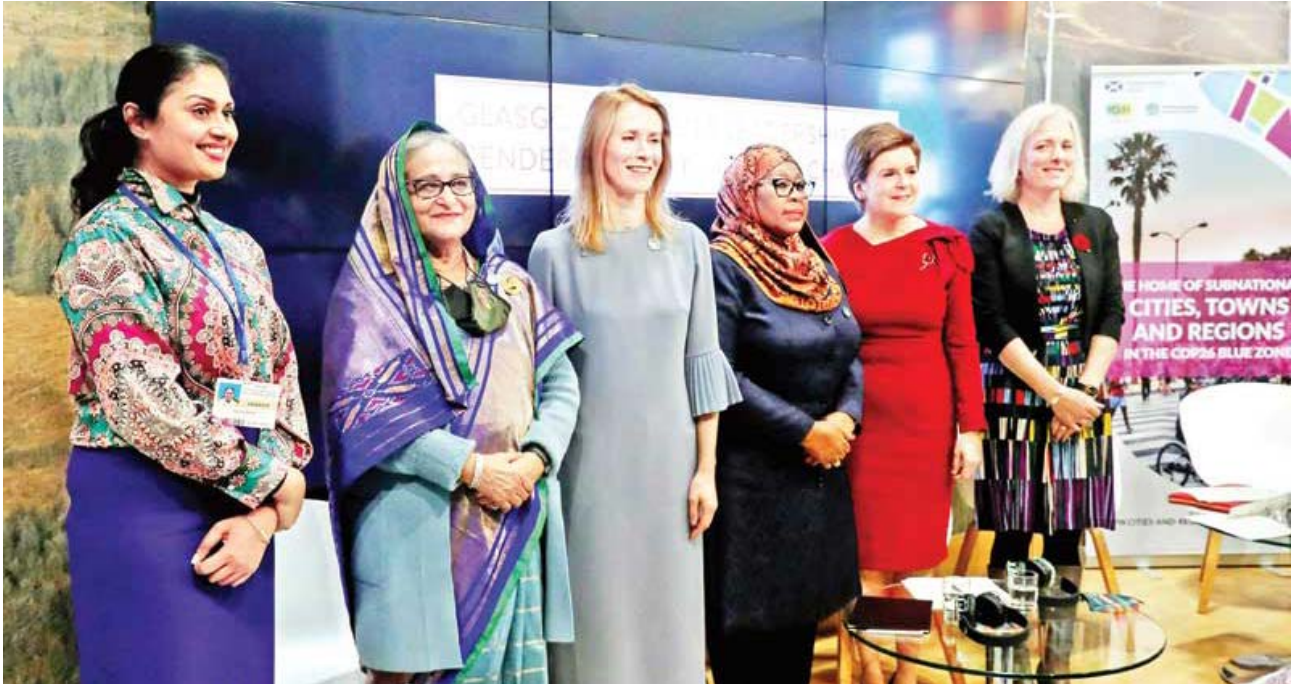
► Hon'ble Prime Minister with Estonian Prime Minister Kaja Kallas, Tanzanian President Samia Suluhu and Scottish First Minister Nicola Sturgeon and other distinguished panellists at the COP26 High-Level Panel on Women and Climate Change