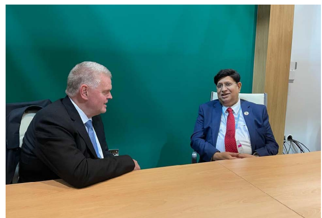
► Chief Executive Officer of HSBC Noel Quinn called on the Hon'ble Foreign Minister in the sidelines of the COP26, Glasgow, 01 November 2021