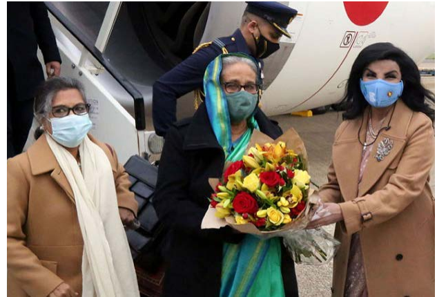
▶ Hon'ble Prime Minister was received at the Heathrow Intl Airport London by Her Excellency Saida Muna Tasneem, Bangladesh High Commissioner in the UK, 03 November 2021