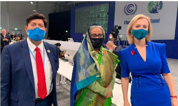
► Hon'ble Prime Minister with Hon'ble Foreign Minister and the British Foreign Secretary Elizabeth Truss MP at the COP26 plenary