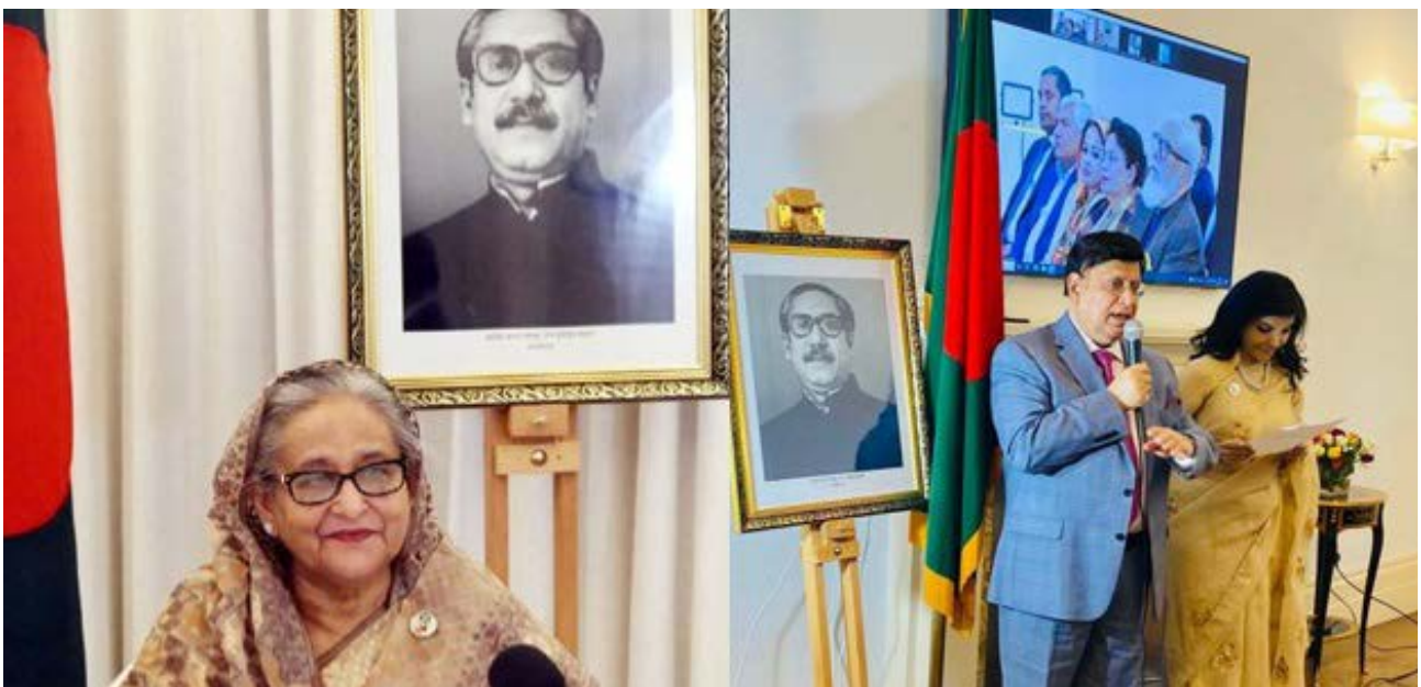
▲ Hon'ble Foreign Minister Dr. A.K. Abdul Momen MP speaking during the inauguration of the BHC London extended Chancery Bhaban on 07 November 2021