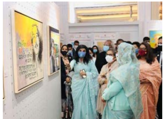
► Hon'ble Prime Minister inaugurating the Bangabandhu Birth Centenary Painting Exhibition organized by Bangladesh High Commission, London in partnership with the Institute of Fine Arts and Chitrak Gallery, 04 November 2021, London